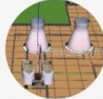
Security and Safeguards